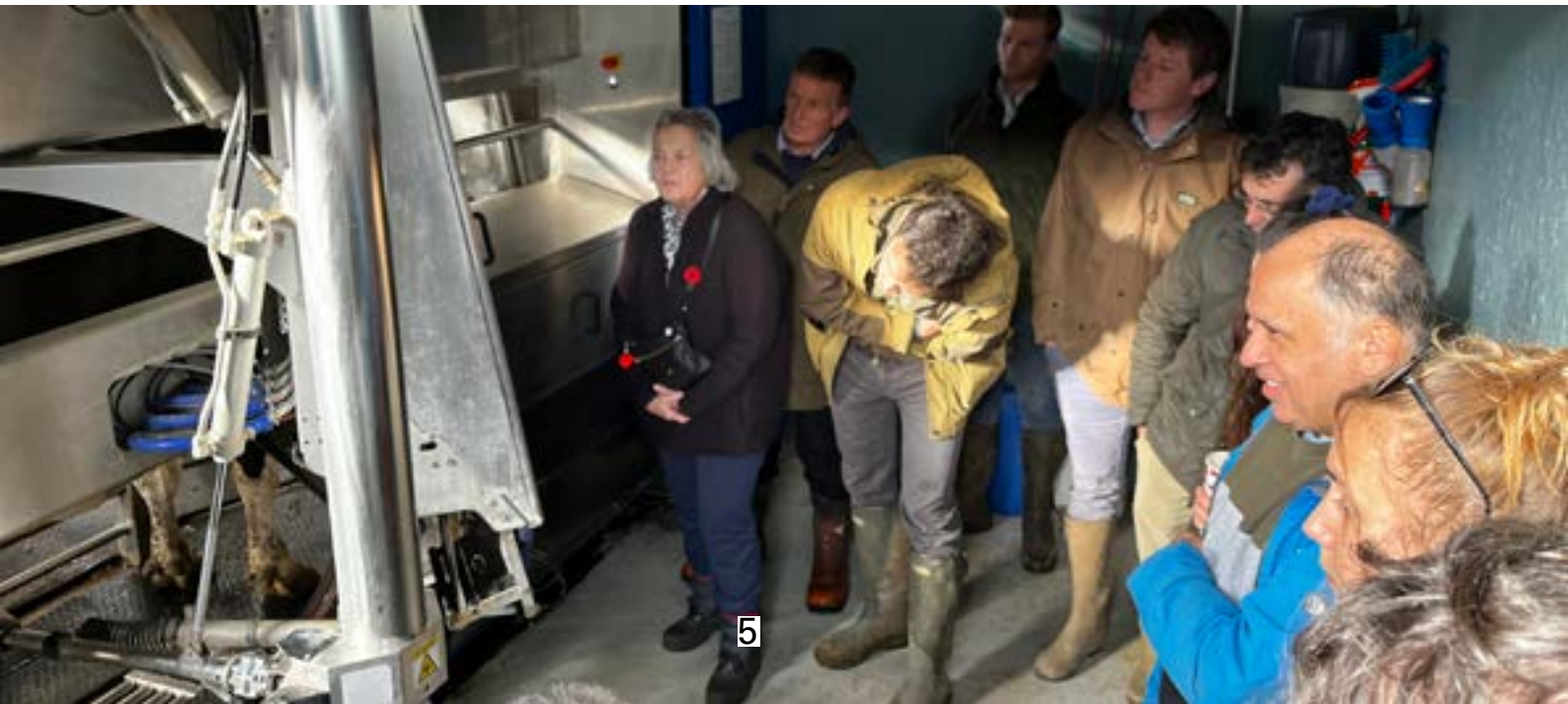
Members visit to Mill Farm Tharston in November 2022