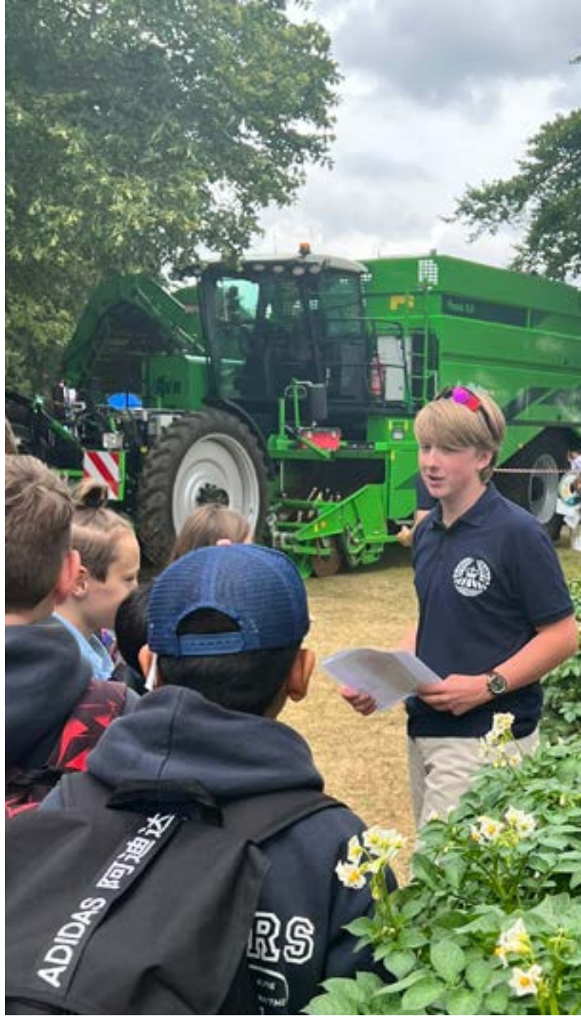
Langley School Student Ambassador at the Royal Norfolk Show 2022