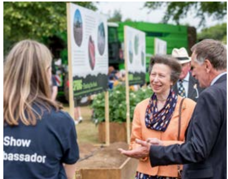
HRH The Princess Royal meets a Show Ambassador

In September the FFDT's new digital hub was released, a learning platform full of information and exciting resources to help young people learn more about food, farming and the countryside. This platform is designed to grow and develop alongside the FFDT. The digital hub contains exciting interactive elements for users to explore, including the interactive What's In The Field, allowing visitors to learn about Norfolk Agriculture by region and by season and a careers section with engaging videos.