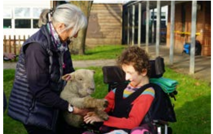
Learn about Livestock project 2022

"I loved it. The staff loved it. The parents loved it. And the children thought it was incredible!"