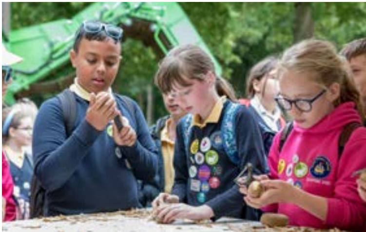
School children at the Discovery Zone

The Discovery Zone is the hub for learning at the Royal Norfolk Show. Themed on the staple crop the potato, the zone offered engaging activities for students to take part in, even providing the opportunity for students to make and try their own chips! Over 8500 school age children visited from over 102 schools, numbers we hope to see increase for 2023.