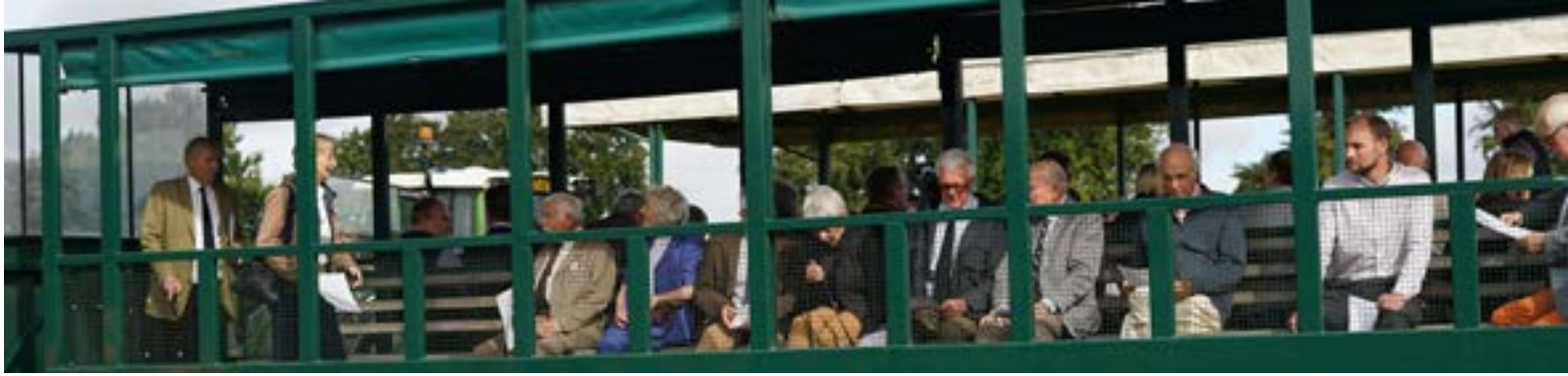
Members visit at the Houghton Estate September 2022