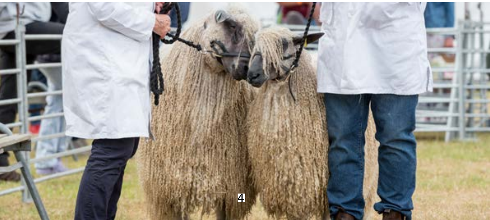
Wensleydale sheep at the Royal Norfolk Show 2022